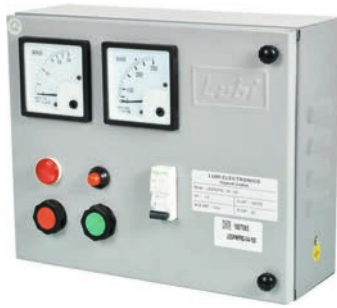
CONTACTOR MCB PANEL (V3, V4)