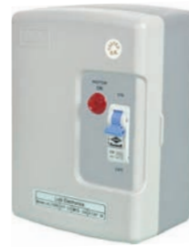
MCB PANEL (Openwell Submersible)